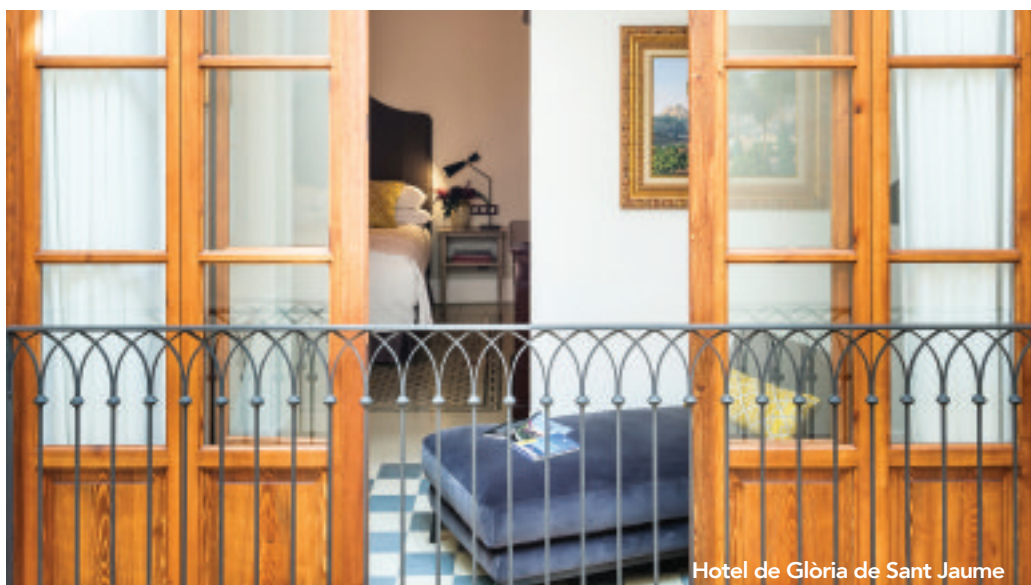
Hotel de Glòria de Sant Jaume