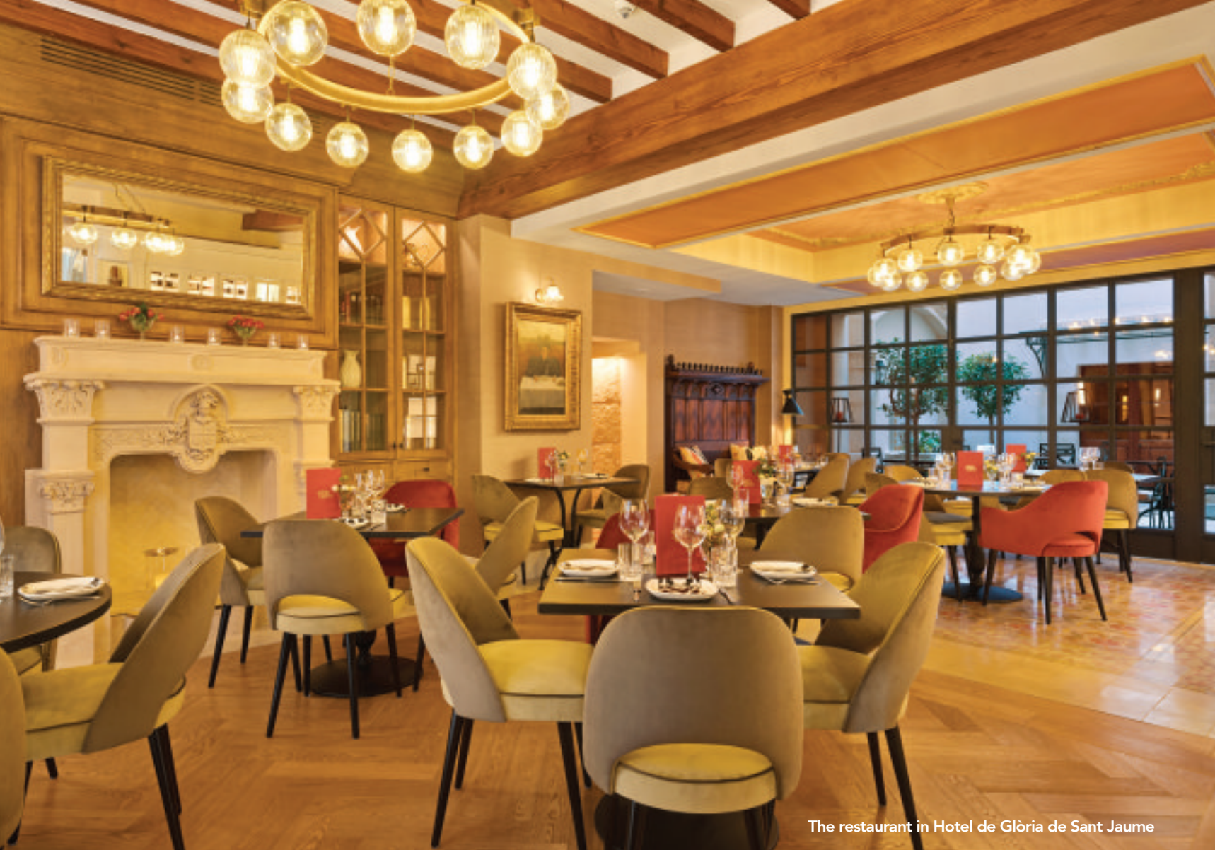
The restaurant in Hotel de Glòria de Sant Jaume