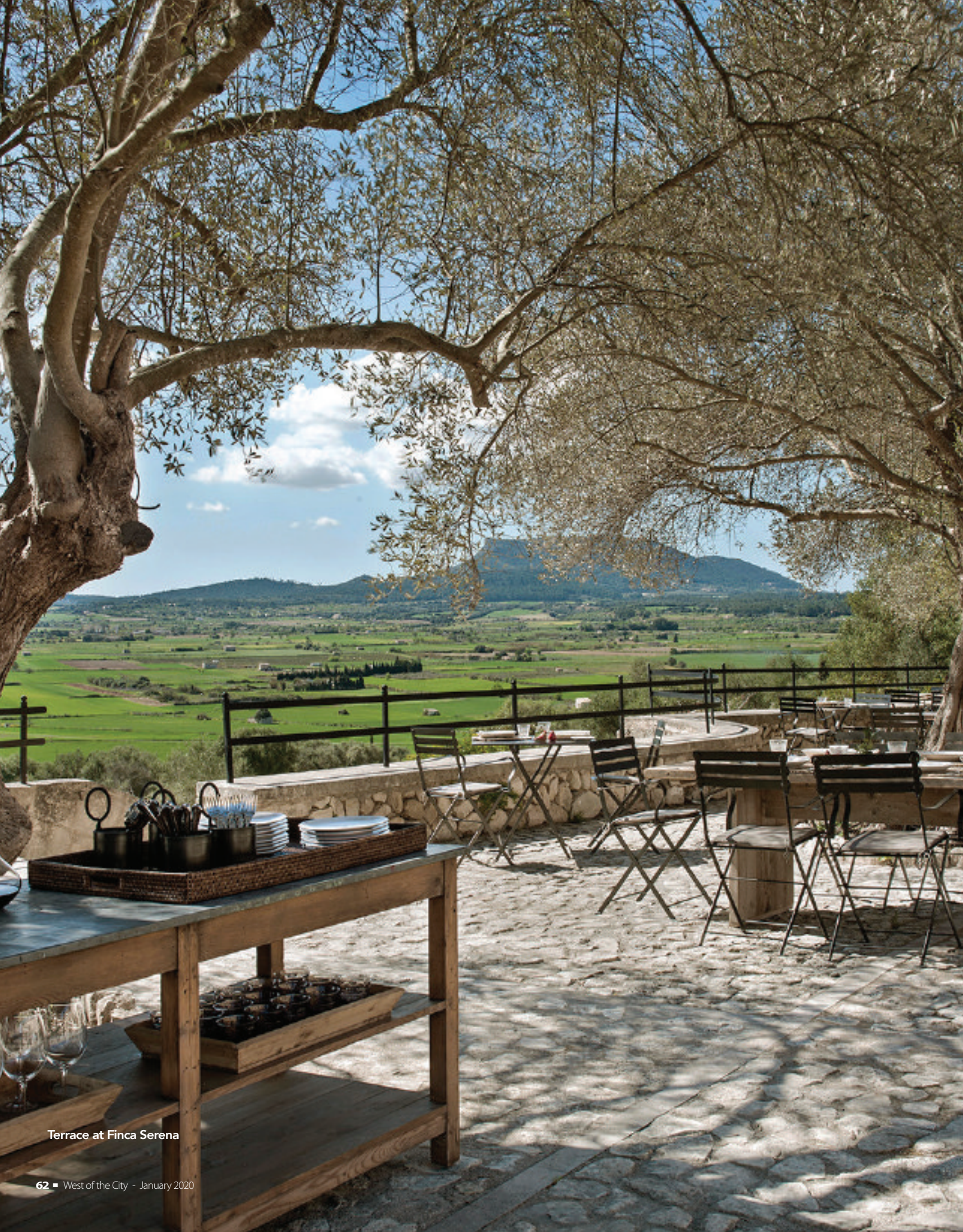
Terrace at Finca Serena