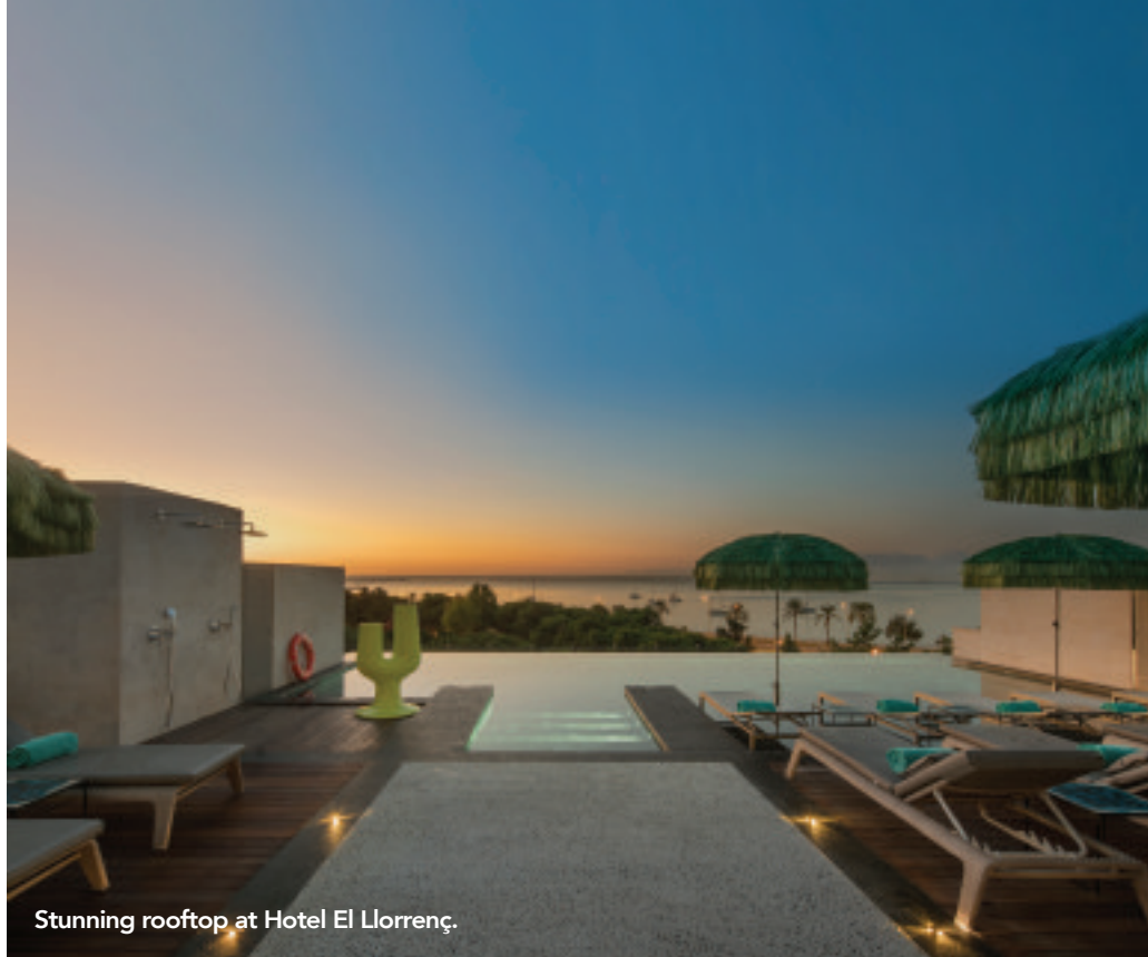
Stunning rooftop at Hotel El Llorenç.

The rooftop of the estate is an outdoor space to enjoy the tranquility of the old town for a few hours under the sun, view of the Palma skyline and relax in the large Jacuzzi. The perfect place for cocktails and lunch. We treat ourselves to a full day traipsing between the roof and the underground spa to fully appreciate the luxurious and elegant vibe of the hotel. →