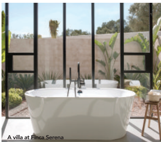
A villa at Finca Serena